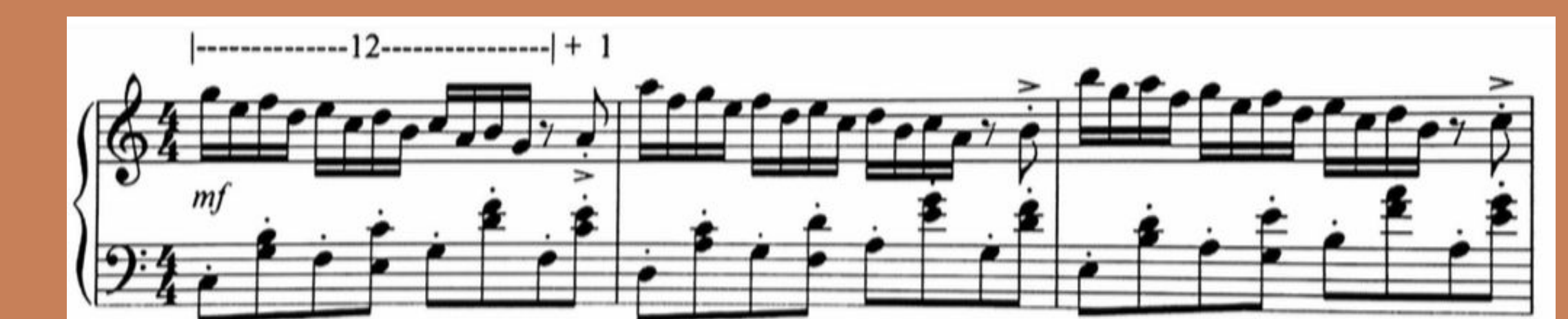
Figure 5: "12 + 1 is a Lucky Number," mm. 7-10, from Ananda Sukarlan's Alicia's Fifth Piano Book .