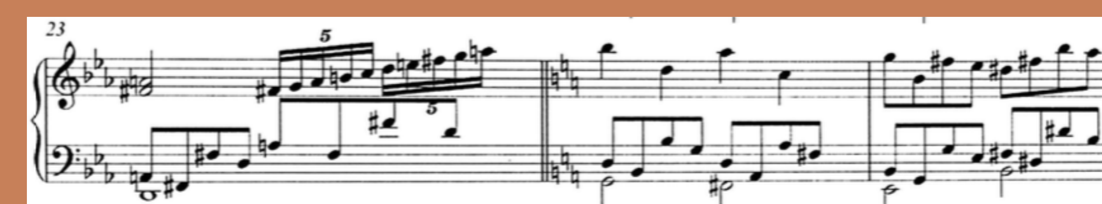
Figure 4: "Calling Me But Love...," mm. 23-25, from Ananda Sukarlan's Alicia's Fourth Piano Book .