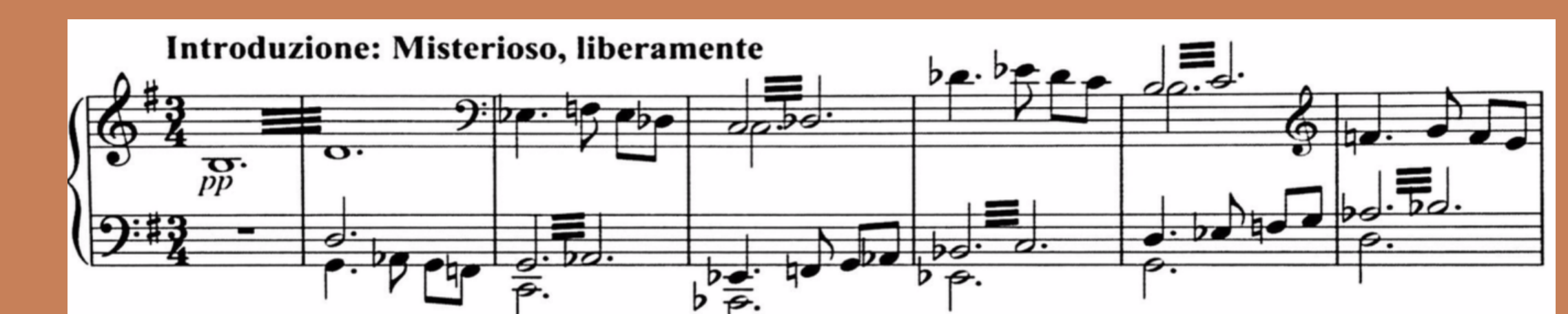
Figure 6: "Variations of Ibu Sud's 'Kupu-Kupu Yang Lucu,'" mm. 1-7, from Ananda Sukarlan's Alicia's Sixth Piano Book .