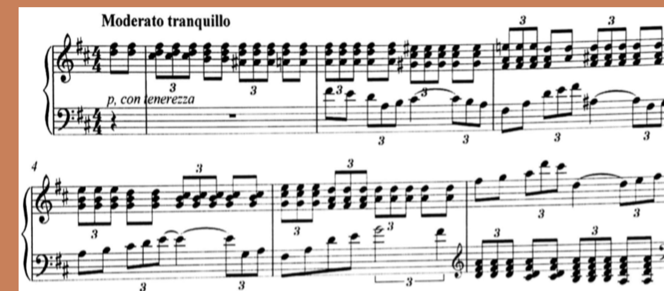
Figure 3: "Difference Unite," mm. 1-6, from Ananda Sukarlan's Alicia's Third Piano Book .